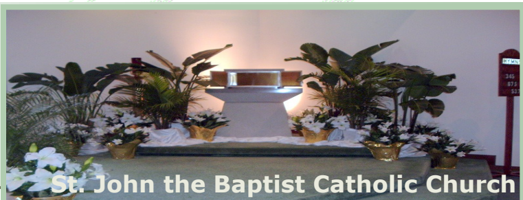
St. John the Baptist Catholic Church