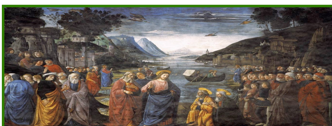
Domenico Ghirlandaio, Calling of the Apostles , 1481

transitional diaconate is a step toward the priesthood.