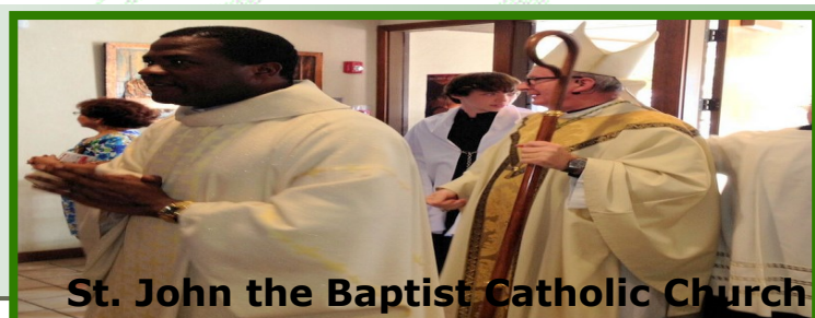
St. John the Baptist Catholic Church