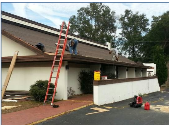
Hall Roof Repaired