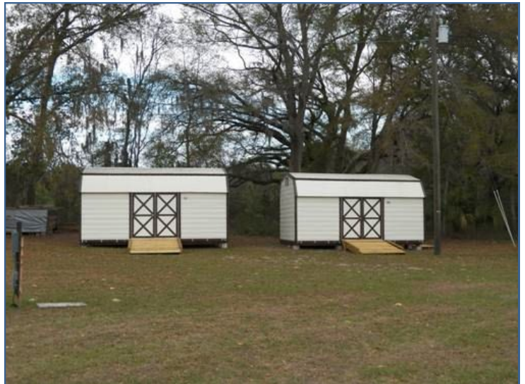
New Storage Sheds