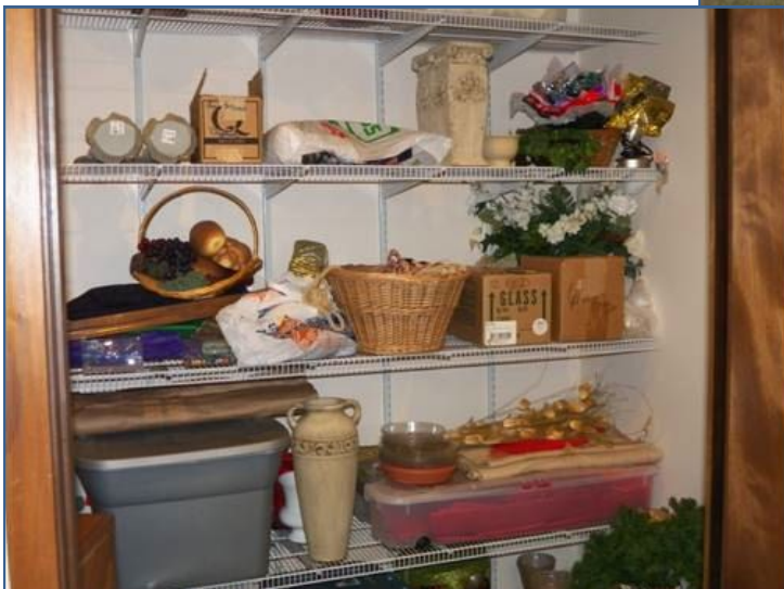
Liturgy Storage Close in Cry Room