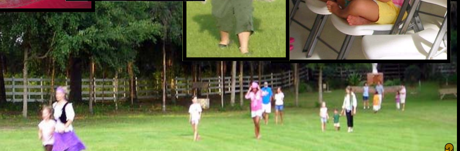
Presented by St. John's Youth Group "The Divine Game"